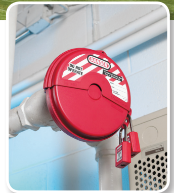
ELECTRICAL & VALVE SAFETY